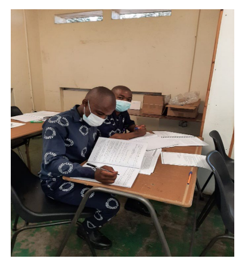
Figure: Lecturer presenting workshop topics